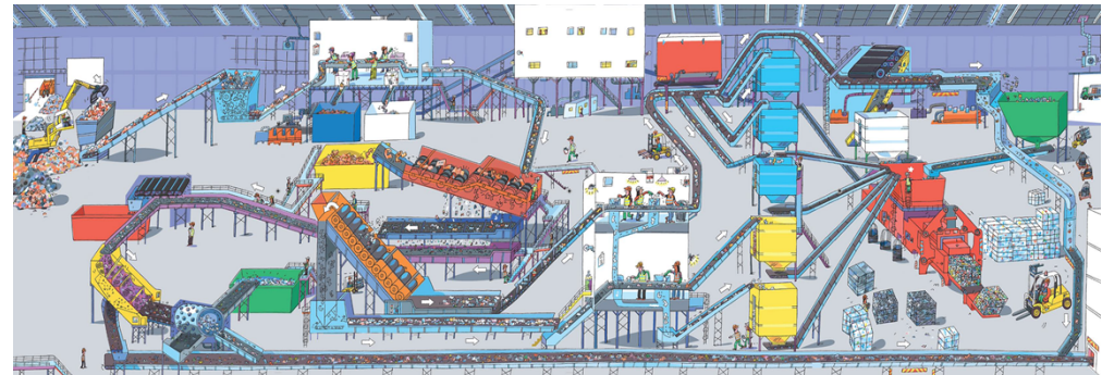
Figure 6: Picture commissioned by Bywaters of their MRF