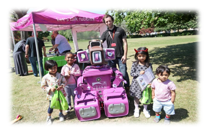
Figure 5: Veolia's R3cycler mascot

involved through influencing behaviour at an early stage and getting them to influence their parents.