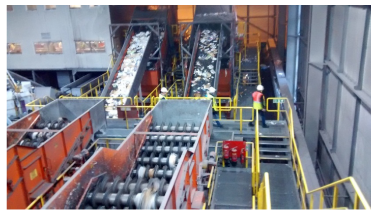
Figure 4: Bywaters MRF paper and cardboard sorting machinery

4.7 There has been a drop in the value of recyclable material due to the falling price of oil and the slowdown of the Chinese economy. In addition, new legislation covering reporting by Materials Recovery Facilities on the quality of recyclable materials produced by them, are making MRF operators more vigilant about the quality of recyclable materials they receive from local authorities.