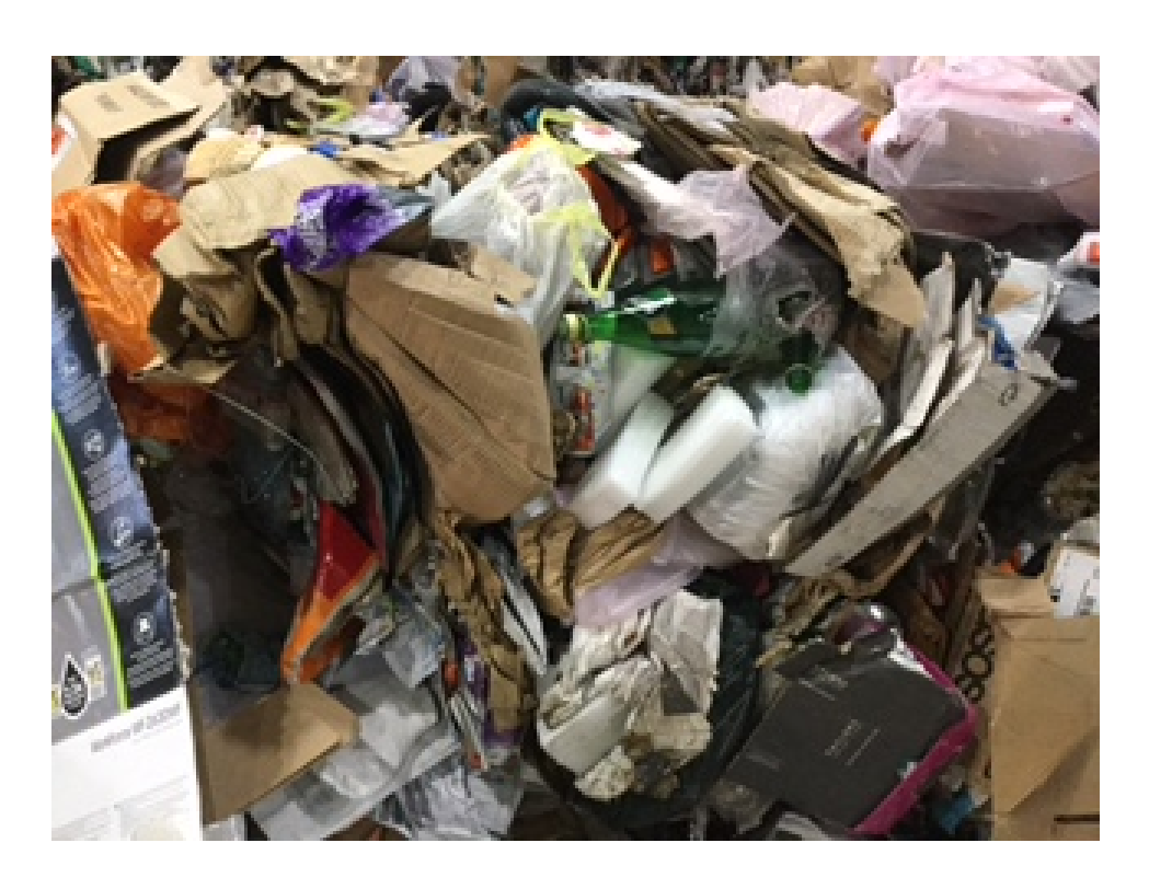
London Borough of Tower Hamlets April 2016